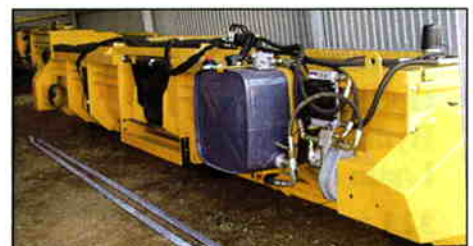
Champion header 6,1m Busatis Bidux with Hydraulic Power Pack 60L/mm (option).