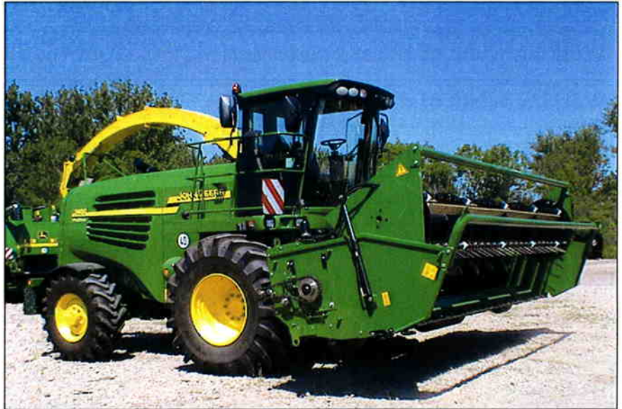
Champion header 5.1 m. Busatis Bidux for John Deere .

CHAMPION direct cut headers are build up on a profile chassis frame, with adaption for different marks of forage harvesters and carriers/tractors.