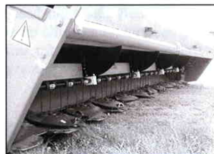
4,9m disc header, standard mechanical driven auger and reel. Standard fix reel.

Cutterbar transmission: Ask for options.