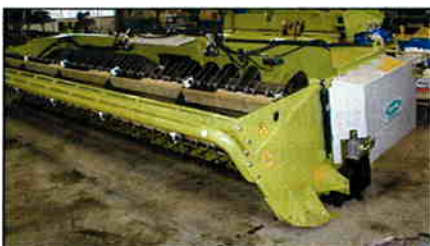
Champion header 6.1 m. Busatis Bidux hydraulic for Claas Serie 8/9. Reel hydraulic up and down (option).

When headers are ordered as windrover headers, we can supply with different types of transmission systems adapted to different carriers. Also different solutions for pick up width.