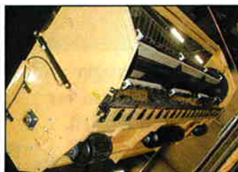
Champion header Busatis Bidux for New Holland FX.