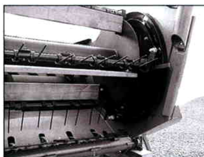
Closed cam track with wide bearings.