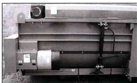
Option Hydraulic operated stubble height control, double acting.